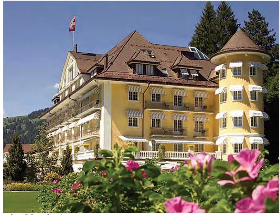
Le Grand Bellevue, Gstaad