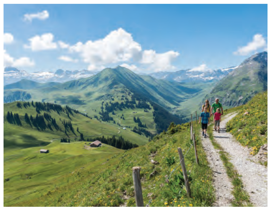
View of Hornegali

We recommend travelling to Switzerland by train from London to Geneva, and then on to Montreux to join the GoldenPass Line for the remainder of the journey to the Saanenland. Return flights from the UK with rail travel in Switzerland can also be arranged. Your destination is Schoenried; a peaceful, mountainside village with stunning views across the five converging valleys. Less than 2 miles away is Gstaad, the popular winter and summer sports destination, known for its main street lined with chalet houses and boutique shops. Rustic restaurants populate the villages and undulating green slopes; streams navigate their way between the mountains; and cable cars, railways, and hiking paths guide you across this fantastic landscape. Use your Swiss rail pass to travel around the villages and towns, stopping in Gstaad, Lauenen, and Zweisimmen.