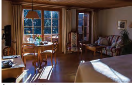
Guestroom at the Alpenrose