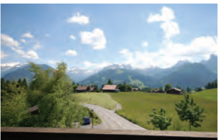
View from the Alpenrose