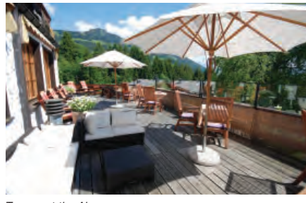
Terrace at the Alpenrose

tables recreate the chalet-feel that Gstaad is known for. Fondue, raclette, and other Alpine delicacies are served with a touch of finedining. For something truly unique, however, dine in the stylish Leonard's Restaurant, which holds a Michelin star. In the afternoons, a light afternoon tea can be enjoyed in the Lounge or in the Garden Lounge outside, which proves to be the perfect place to soak up the summer Swiss sunshine; or sip an aperitif in Bouquet, or sample some sushi in the Sushi Bar. To complete your experience of Le Grand Bellevue, pamper yourself in the world-class Le Grand Spa. The spa features 11 treatment rooms managed by skilled specialists, a rippling indoor pool, Jacuzzi, and yoga and Pilates classes. Guests of Le Grand Bellevue invariably leave feeling refreshed and recuperated, but with the additional experience of exploring the sublime landscapes of the Saanenland.