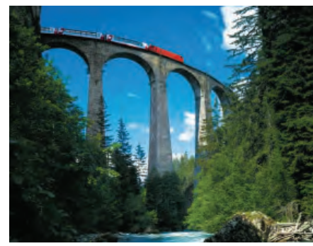
By Rail to Saanenland Holiday